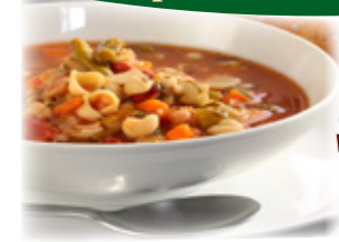
16oz. $4.50 (Includes Garlic Bread)